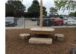
WOODEN PLAY TABLE WITH STUMP AND LOG BENCH SEATING