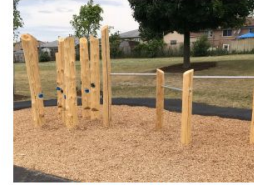
CLIMBING POSTS & PULL-UP BARS