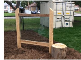
TEMPERED GLASS ART WALL