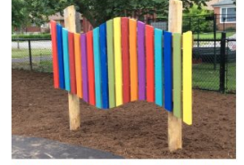
VARIATION OF ABOVE WITH 3 SIDES TO ACT AS A FORT/PLAY HOUSE AS SHOWN BELOW